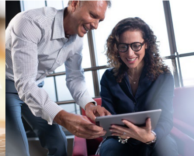
7-8 April 2022