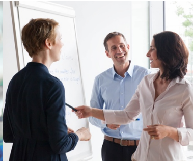
IT Solution Architect